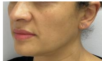
3 weeks after